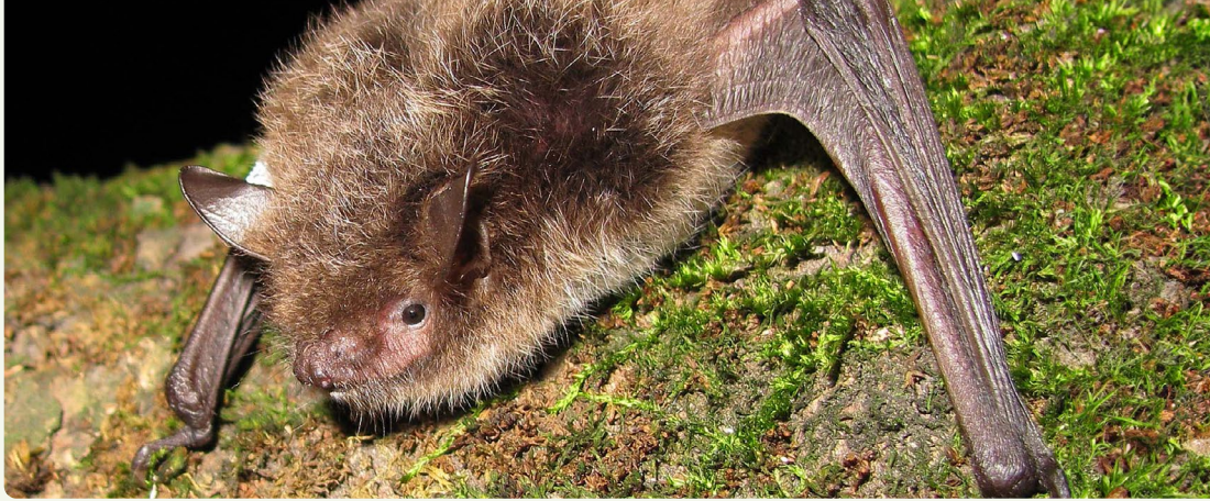
Daubenton's Bat ( Myotis daubentonii )

Sites for bats to roost play a critical role in the conservation of bat populations. Bats do not construct their own roosts and depend on various structures for shelter; both natural (caves, tree hollows, rock cracks) and human-made (buildings, cellars, mines, engineering structures). The availability of suitable roosts is essential for their welfare and maintaining healthy populations. Some bat species depend heavily on artificial structures such as houses, churches, bridges, cellars and other buildings which are highly significant for their conservation. These structures are places with a high probability of "human-bat" interactions, including direct contact through handling (of grounded or injured bats for example). In such places bats (and their welfare) are more dependent on favourable human attitudes.