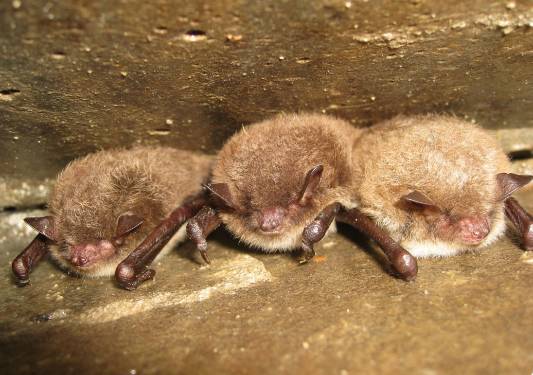
Daubenton's Bat ( Myotis daubentonii )