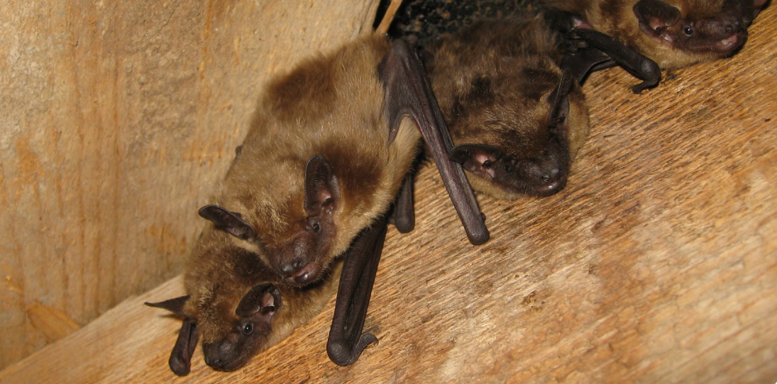
Serotine Bat ( Eptesicus serotinus )