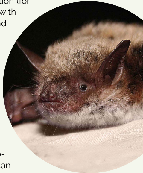
Pond Bat ( Myotis dasycneme )

All relevant details about the discovery (date, location, circumstances, etc.) should be carefully noted and provided to a research centre or laboratory (see Resolution 5.2 for the standard form for submission of bats for rabies testing). Quick and accurate reporting is essential to facilitate proper analysis and monitoring of potential rabies cases in bats, contributing to public health and the conservation of these important creatures.